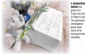
A HEADSTONE MARKS the grave of a 3-year-old child in Potter's Field. The paranormal investigation group does some of its training at the cemetery.